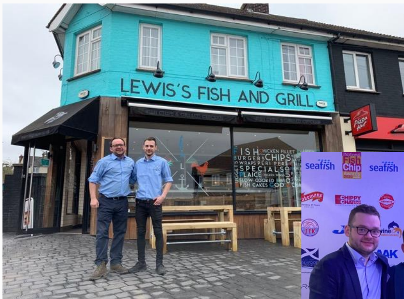
Fish from Gadus