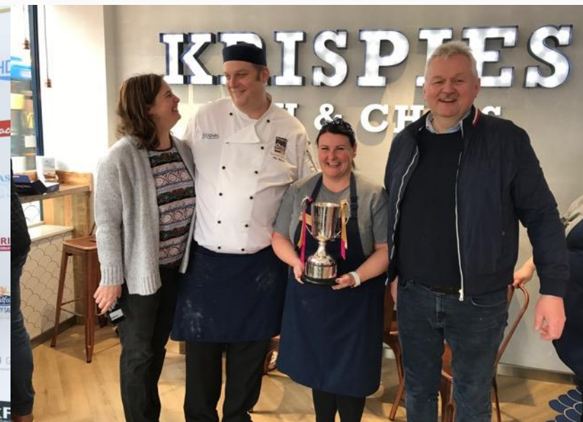
Fish from Gadus